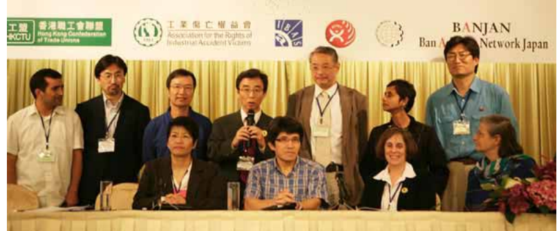
Closing session platform party