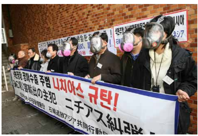
BANKO members demonstrate with BANJAN outside Nichias premises at Oji, Japan.

tected the presence of crocidolite (blue) asbestos; subsequent measurements taken by the Ministry of Labor verified these findings. Samsung denied the contamination;