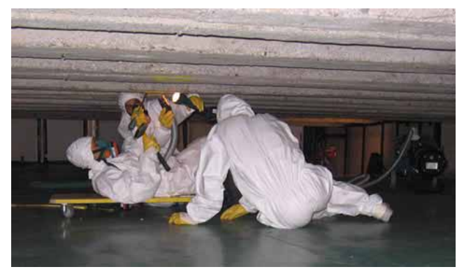
Cramped working conditions

Throughout the asbestos removal, air monitoring was carried out on the passenger platforms of the subway station as well as in the working zone above. The use of scores of photographs by the speaker illustrated the difficulties posed by this project and the technical solutions which