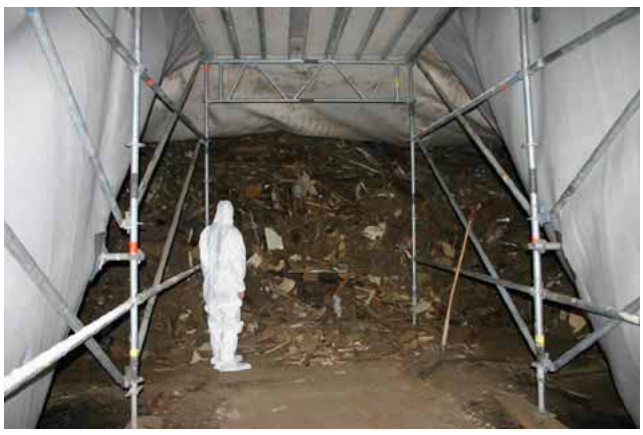
Access tunnel for clearance of contaminated waste.

Kropiunik quantified the problem in Austria, showed photographs of faulty working practices and explained a decontamination program which safely removed huge quantities of asbestos-containing material (ACM) from hundreds of Austrian rail vehicles. According to available estimates, a typical Austrian rail vehicle built during the 1960s-1970s could contain between 40 and 80 kilograms of ACMs; these products were used for acoustic, thermal and electrical insulation and fireproofing. Common ACMs in railway vehicles included sprayed-on asbestos insulation, which was extremely friable and had a high asbestos content, panels, ropes and boards.