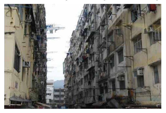
tion [72]. Pictures shown by the speaker revealed the ubiquity of such constructions and the presence of deteriorating asbestos-cement materials.

The number of mesothelioma cases documented in Hong Kong rose from a total of 30 by 1995, to 60+ by 2004; average mesothelioma mortality between 2001 and 2004 was 10 deaths/year with a peak of 15 in 2002. Construction workers featured prominently amongst the groups of workers at risk of contracting mesothelioma due to high levels of asbestos used in the 1960s-1970s and the long latency period of asbestos cancer. In 2006. HKWHC staff, working with sufferers, family members and trade unionists, began a campaign to add mesothelioma to the list of compensated illnesses included in the Pneumoconiosis Compensation Ordinance. Success was achieved when the Pneumoconiosis Compensation Fund Board and the Labour Advisory Board agreed to extend government coverage to include mesothelioma under the re-titled Pneumoconiosis and Mesothelioma (Compensation) Ordinance (2008). Despite this success, the HKWHC remained concerned about the hidden hazard posed by asbestos in 15,600 privately-owned buildings, many of which were built during the era of high asbestos consump-