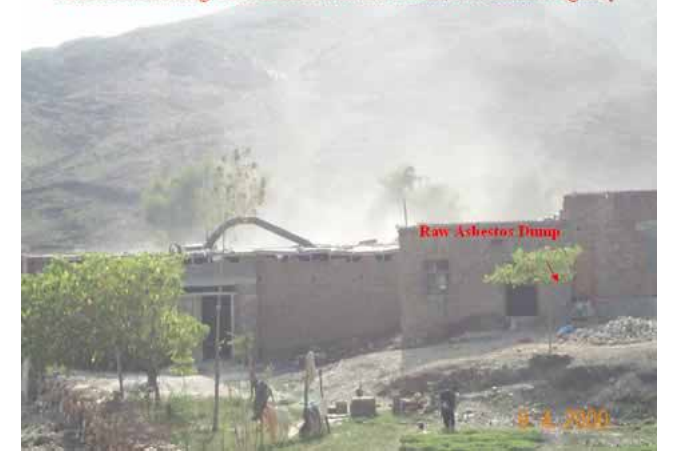
Asbestos Milling Unit Located in Sari Killi, Mohmand Agency

result of these widespread exposures, there were high incidences of asbestos-related cancers such as mesothelioma [64] and cancers of the lungs, larynx, gastrointestinal tract and ovaries in Pakistan [65]. It was likely that asbestos mortality would rise dramatically in the coming decades. In July 2005, Pakistan ratified the Rotterdam Convention [66]. Since then the government had set up a National Technical Advisory Committee on Chemicals which had its first meeting in 2008. At a subsequent meeting on April 21, 2009, data which the speaker had accumulated since 1990 on asbestos issues in Pakistan were presented; as a result of this the government decided to include all types of asbestos on a list of hazardous materials. The minutes of that meeting noted: