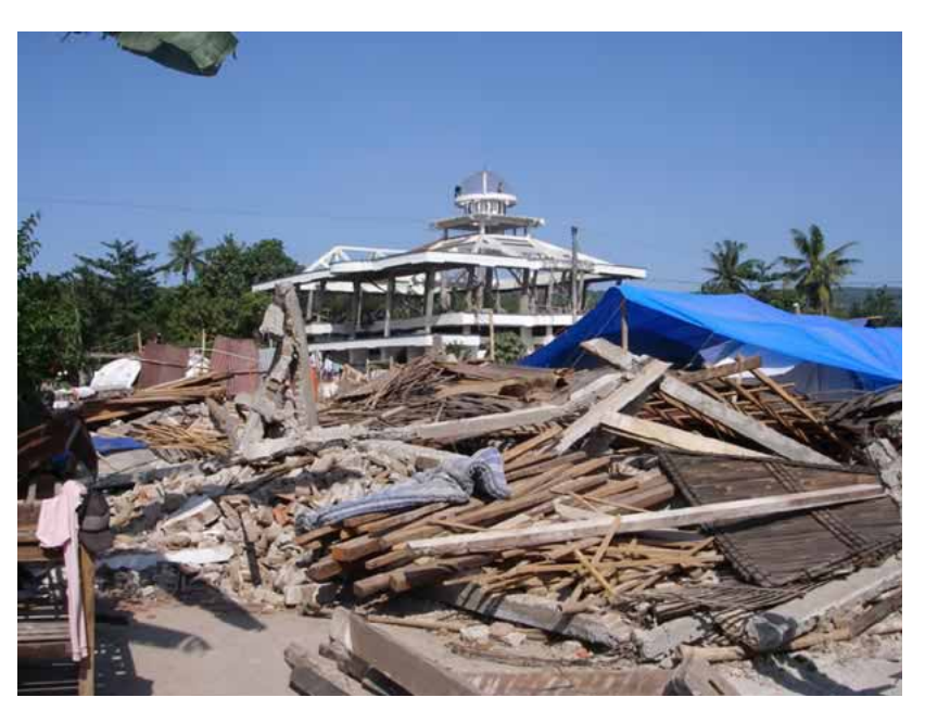
In the aftermath of natural disasters, clean-up operations usually require the removal of large amounts of contaminated debris, as evidenced by this mound of building rubble at Aceh.

"Current guidelines," the speaker said "are complex and ineffective." What was needed was more broadly agreed and much simpler messaging like "keep it wet," on posters, leaflets etc. that could be pre-prepared in local lan-