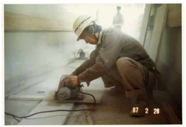
Cutting operations resulted in exposures as high as 787 fibers/ml. Here, the level was 131 fibers/ml

ernment for mesothelioma and lung cancer, of which 1,387 (41%) worked in construction [36]; the second highest group affected were workers in shipbuilding who accounted for a total of 444 cases (13%).