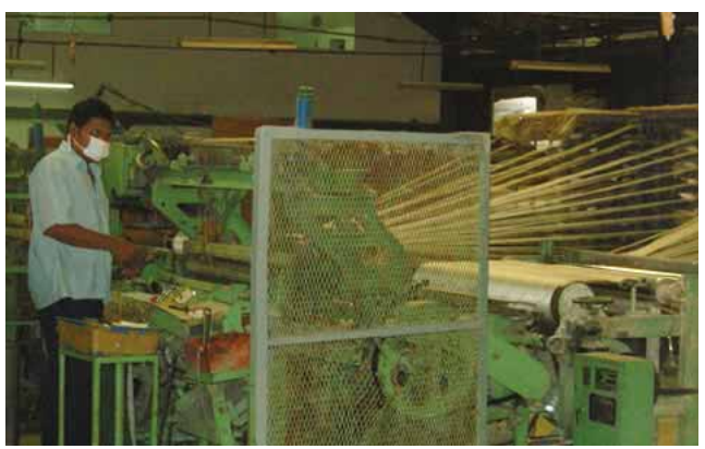
Asbestos textile production at PT Jeil Fajar factory

about the local asbestos textile factories and nothing about asbestos-related diseases;